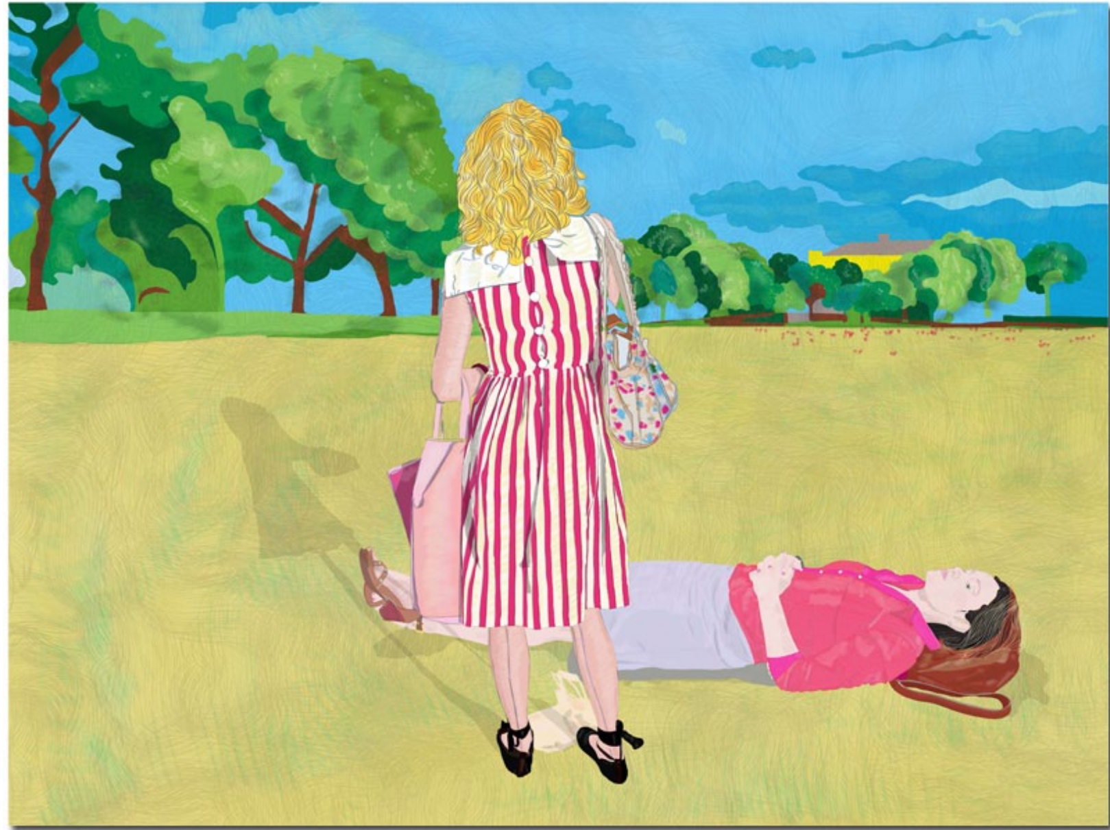
Grass. Inkjet printed drawing on paper, 55x45cm, limit ed of 7 , 2011

ITALIAN INSTITUTE OF CULTURE 11 Fitzwilliam Square East, Dublin 2 June 9th 2011 7:00 pm