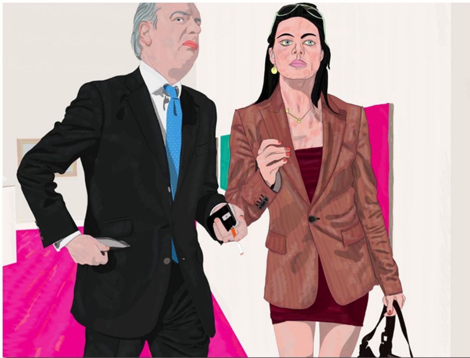
Art connoisseurs. Inkjet printed drawing on paper, 55x45cm, limit ed of 7 , 2011