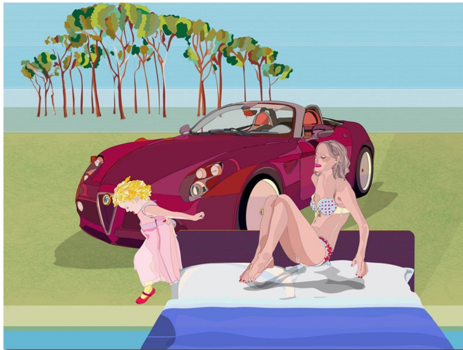
Dreans and beauty. Inkjet printed drawing on paper, 55x45cm, limit ed of 7 , 2010

ITALIAN INSTITUTE OF CULTURE 11 Fitzwilliam Square East, Dublin 2 June 9th 2011 7:00 pm