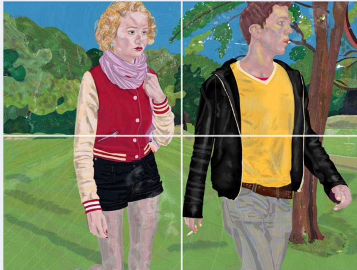
Evening walks in Merrion Square. Inkjet printed drawing on canvas, 200x150cm (four panels), limit ed of 7 , 2011