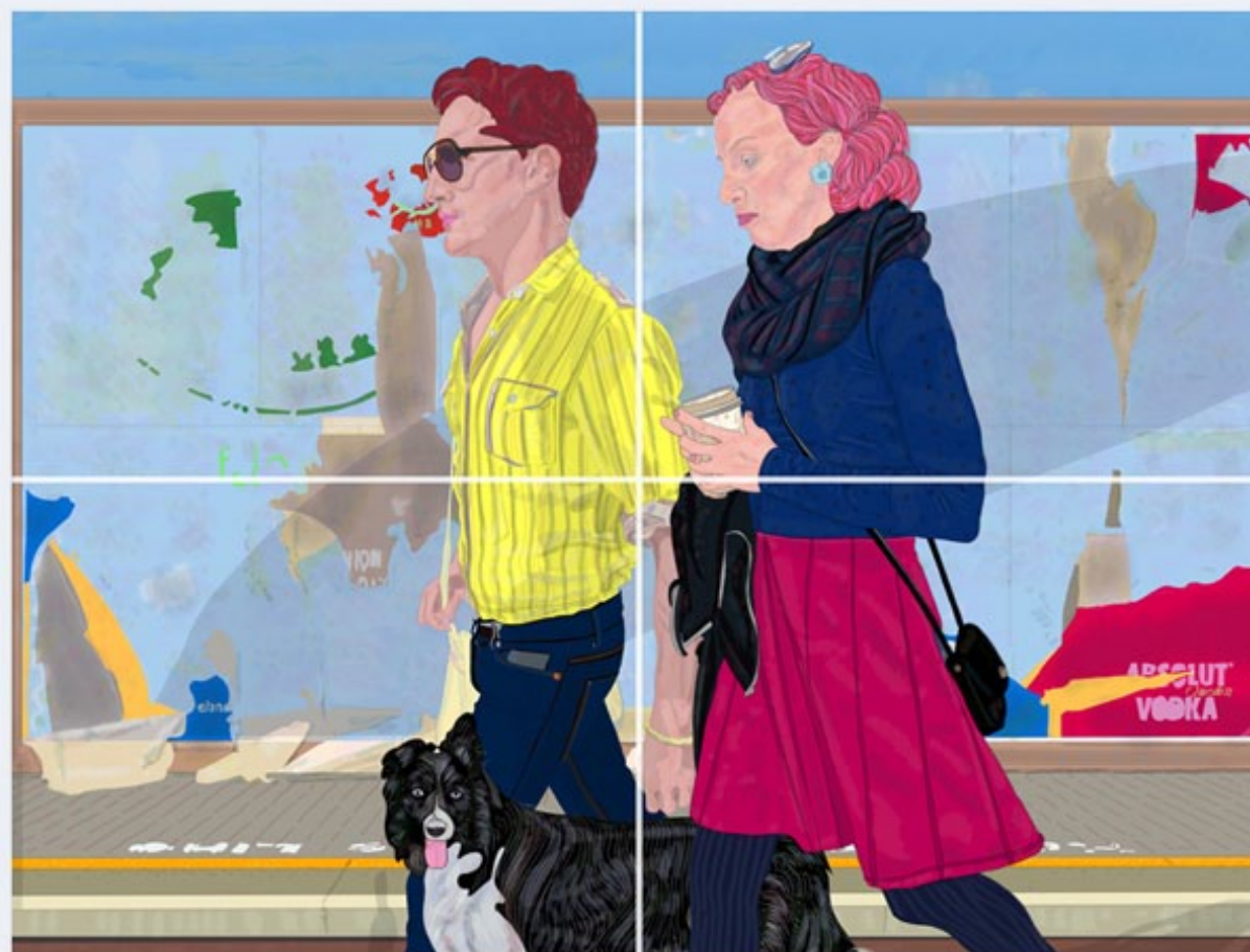
Silent journey. Inkjet printed drawing on canvas, 200x150cm (four panels), limit ed of 7 , 2011