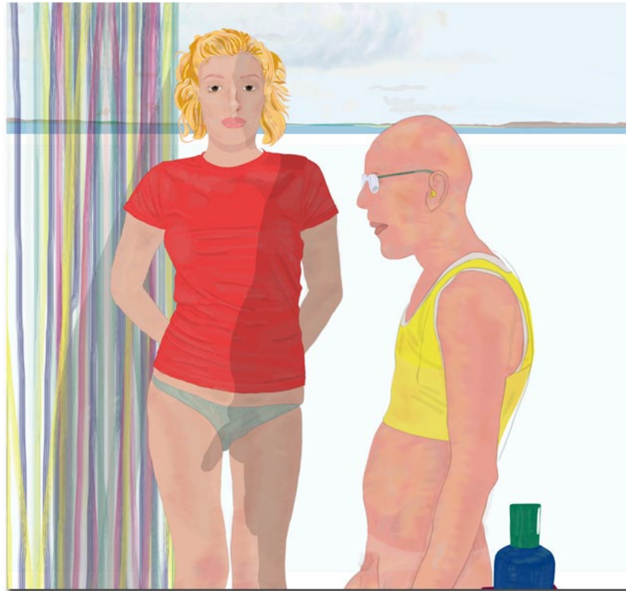
A couple with an attitude. Inkjet printed drawing on paper, 42x38cm, limit ed of 7 , 2011

THE KENNY GALLERY, LIOSBÁN, TUAM ROAD, GALWAY July 2nd 2011 2:00 pm