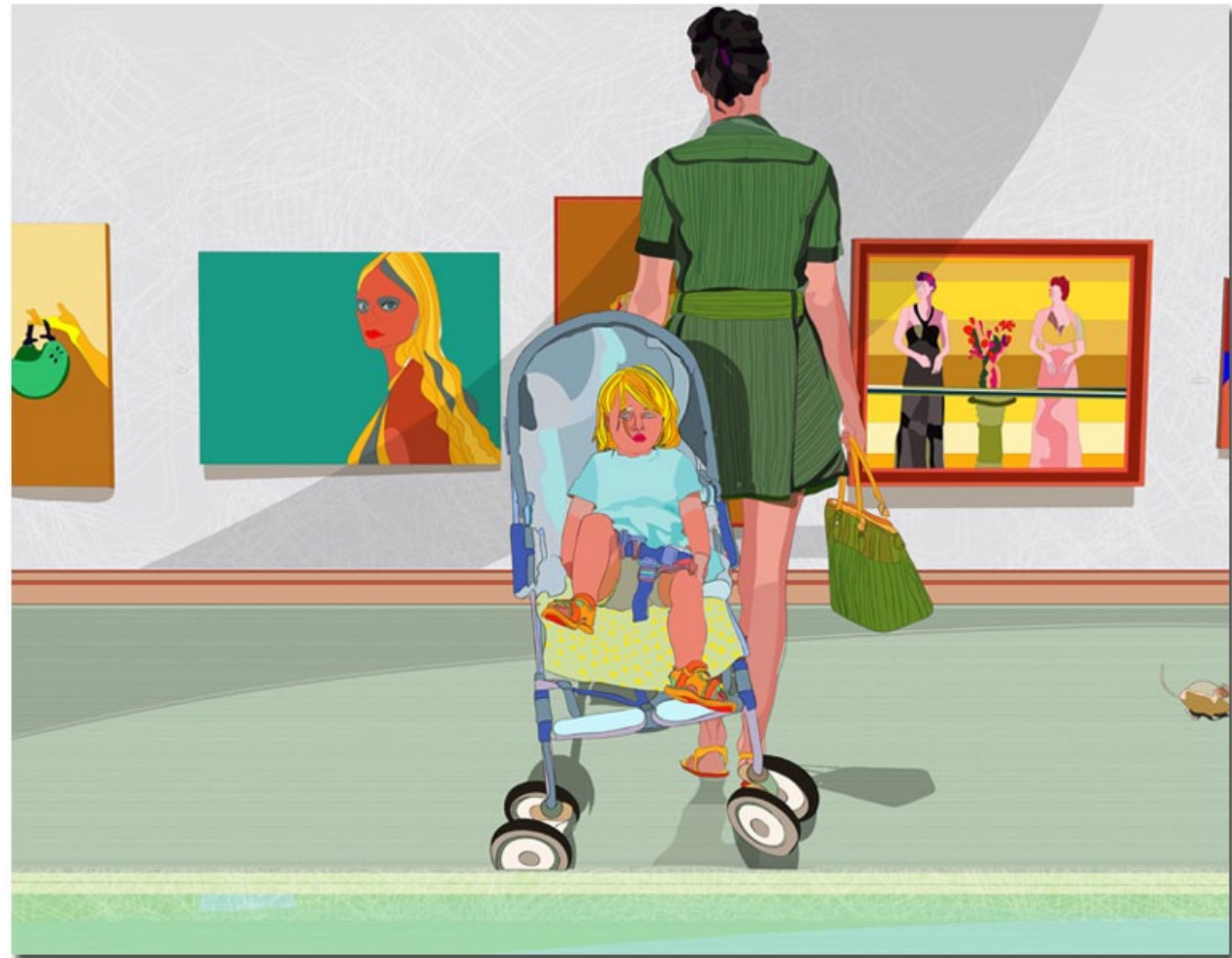
Art lovers. Inkjet printed drawing on paper, 55x45cm, limit ed of 7 , 20110

EURO SHOW - AMSTERDAM WIEDEN + KENNEDY GALLERY 258 Herengracht, Amsterdam June 16th 2011 7:00 pm