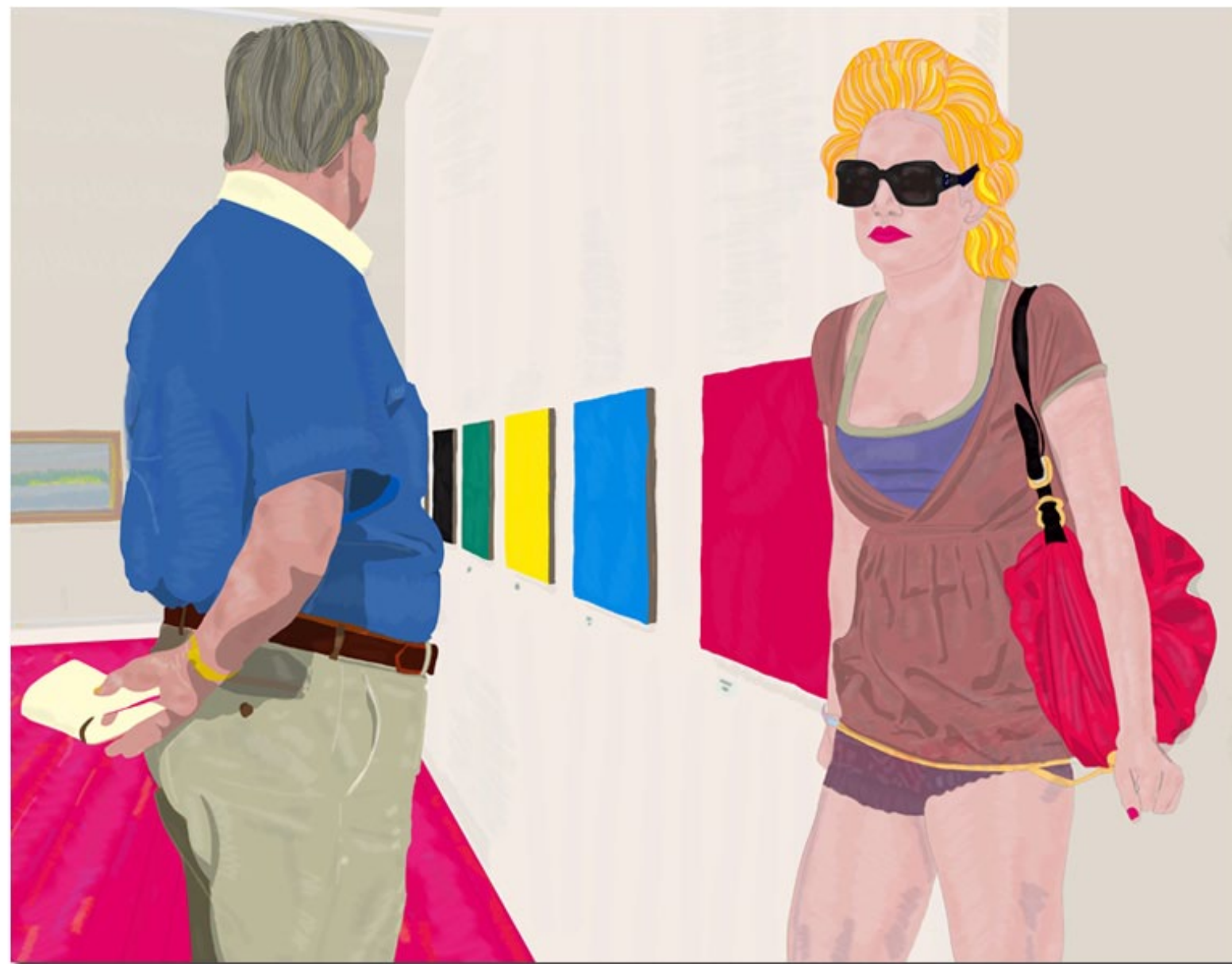
Art gallery. Inkjet printed drawing on paper, 55x45cm, limit ed of 7 , 2011